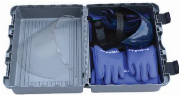
Cryogenic safety equipment